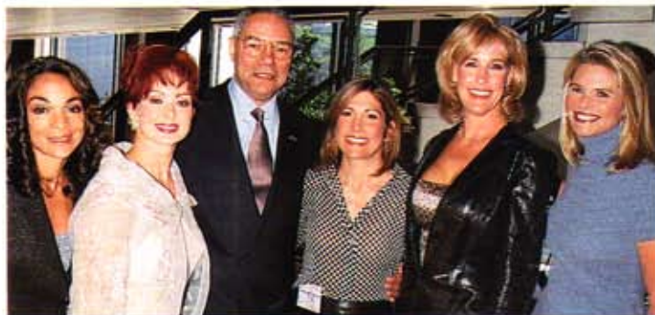
Gen. Colin Powell and me (center) with some of our celebrity Mothers & Shakers. See page 17 for more photos from our awards luncheon.